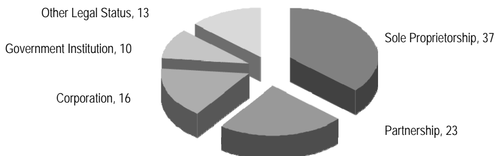
Figure 15.1 Percentage of commercial farms, by legal status of the holders: October 2007