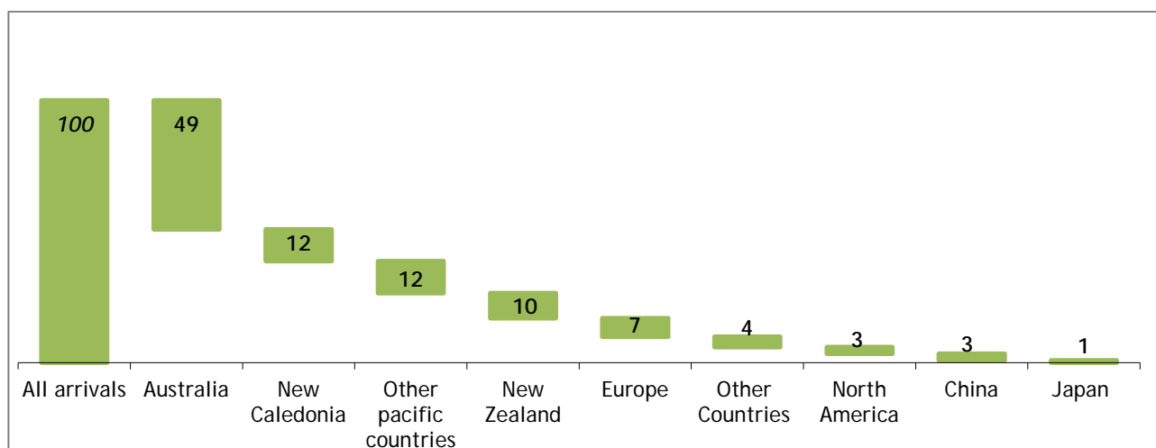
Fig 2: Percentage share of visitors in November 2017 by Country of Usual Residence