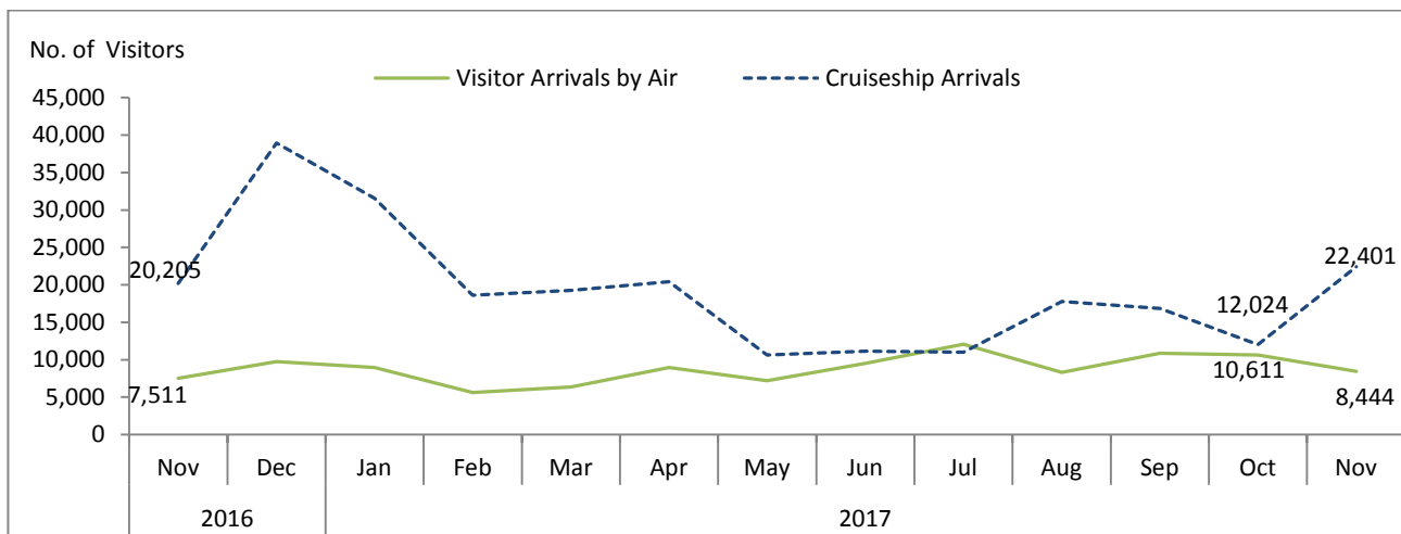
Fig 1: International Visitor Arrivals: November 2016 to November 2017